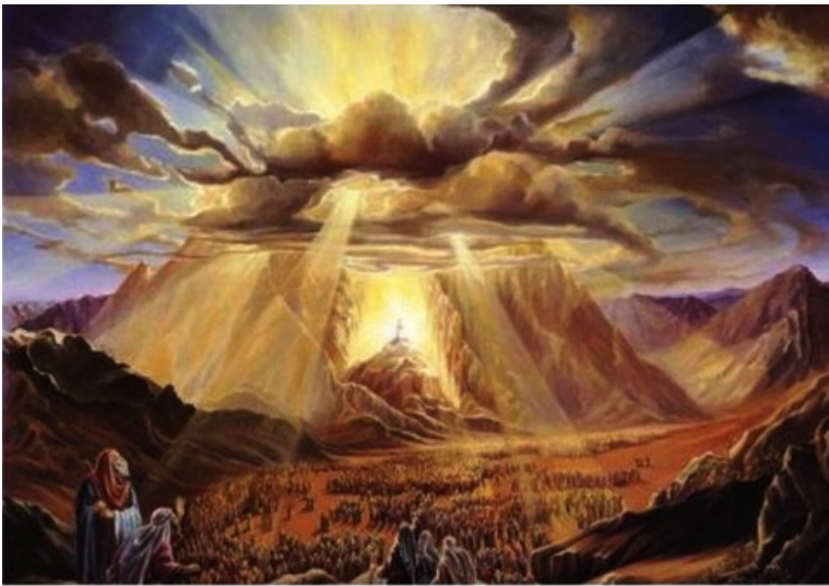
Mt Sinai by Eizen

You came near and stood at the foot of the mountain and the mountain burned with fire to the very heart of the heavens: darkness, cloud and thick gloom - What Israel saw was a manifestation (and only a small one at that) of Yahweh's omnipotence.