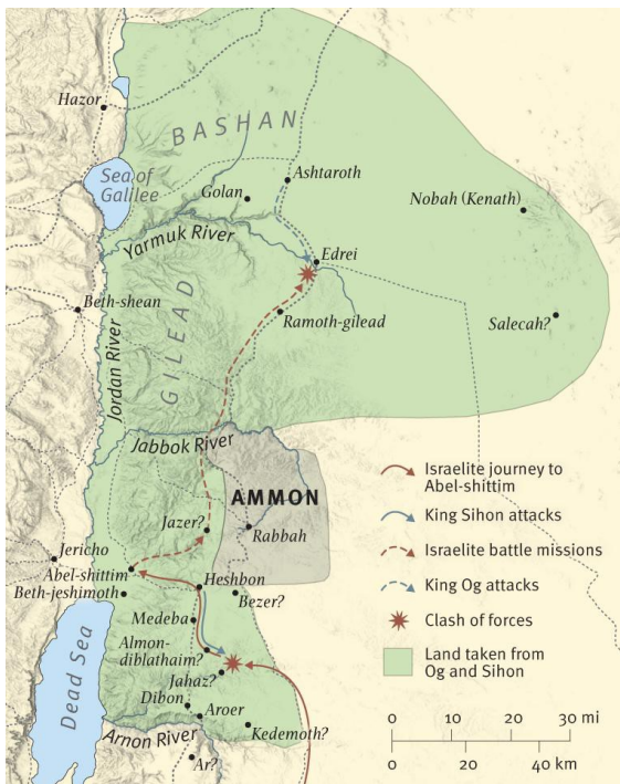
Israel Defeats Og and Sihon (ESV Study Bible) (Click to Enlarge)

Across the Jordan, in the valley opposite Beth-peor, in the land of Sihon king of the Amorites who lived at Heshbon -Beth-peor: Beth-peor was a city which was situated, according to Eusebius, opposite Jericho, and six miles above Livias. As the name signifies "the house of Peor," it is probable that there was a temple to Peor, situated in this place, full in view of the people, while Moses was pressing upon them the worship of Jehovah alone; and perhaps the very temple where so many had sinned to their own destruction.